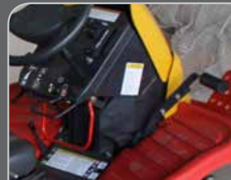
Forward and Reverse control.