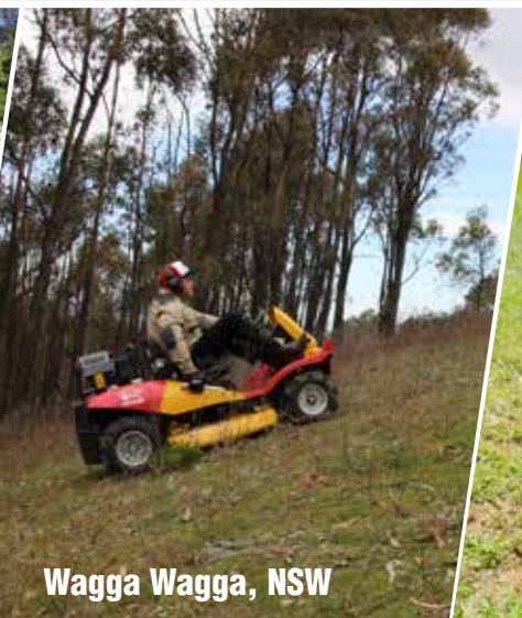
Wagga Wagga, NSW