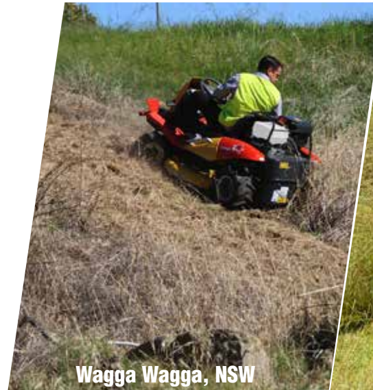
Wagga Wagga, NSW

Diff Lock: Selectable Positive Diff Lock