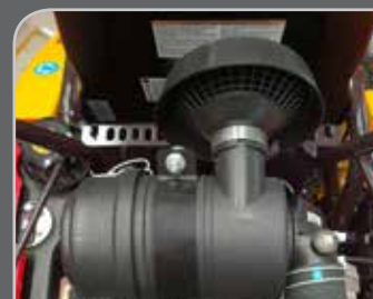
Donaldson air cleaner with Cyclone Pre-cleaner.