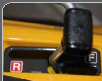
Easy cruise control style ground speed control.