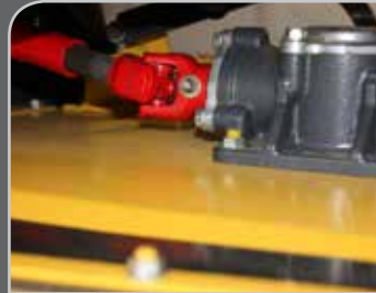
Super tough shaft driven gearbox.