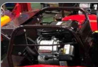
4WD 18HP VANGUARD ENGINE.