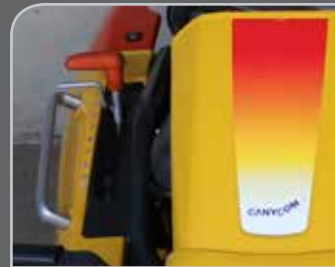
Easy and convenient height of cut control.