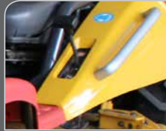
Easy cruise control style ground speed control.