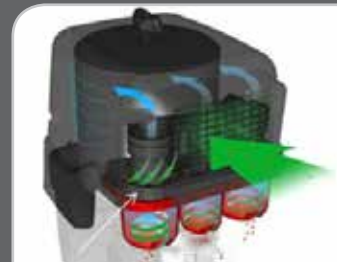
NEW "Cyclone" air cleaner system.