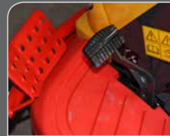
Easy park brake/foot brake control.