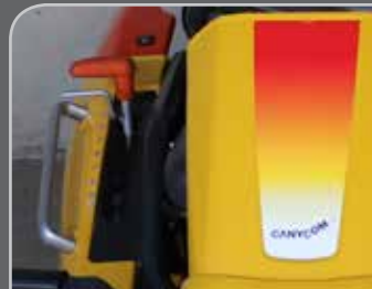
Easy and convenient height of cut control.