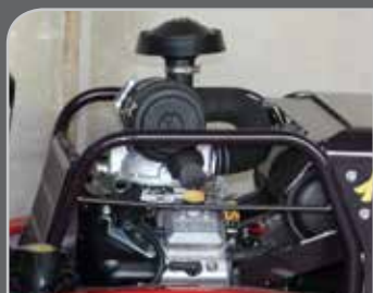
23HP V-Twin Vanguard Engine.