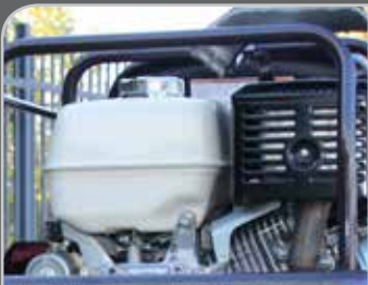
2WD Honda GX390 Engine.