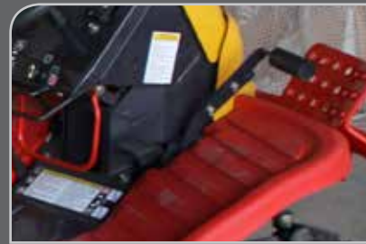
FOOT PEDAL HEEL/TOE FORWARD REVERSE.