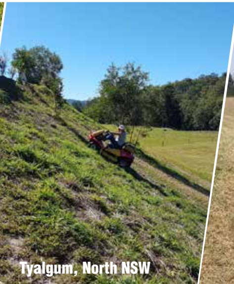
Tyalgum, North NSW