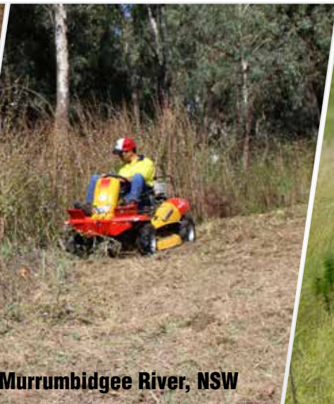
Murrumbidgee River, NSW