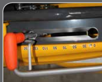
Easy and convenient height of cut control.