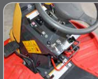
Dash mounted Diff Lock/dual range 2WD/4WD controls.