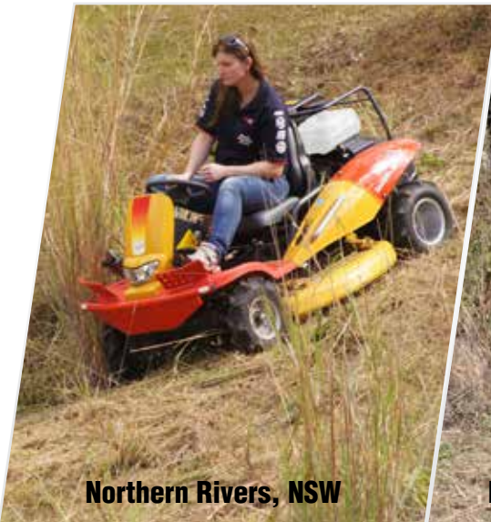
Northern Rivers, NSW