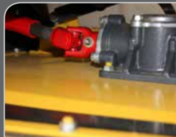
Super tough shaft driven gearbox with adjustable discharge deck.