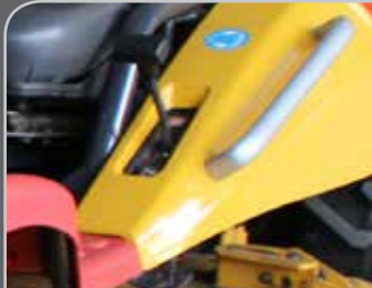
Easy cruise control style ground speed control.