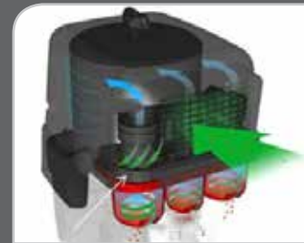
NEW "Cyclone" air cleaner system.