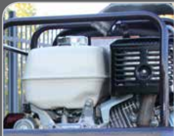
4WD Honda GX390 Engine.