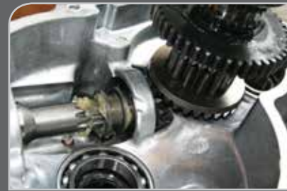
SHAFT DRIVEN 4WD.