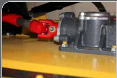
SUPER TOUGH SHAFT DRIVEN GEARBOX WITH ADJUSTABLE DISCHARGE DECK.