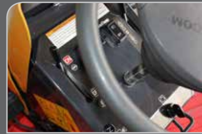
DASH MOUNTED DIFF LOCK AND 4WD CONTROLS.