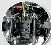
LINKAGE & PTO